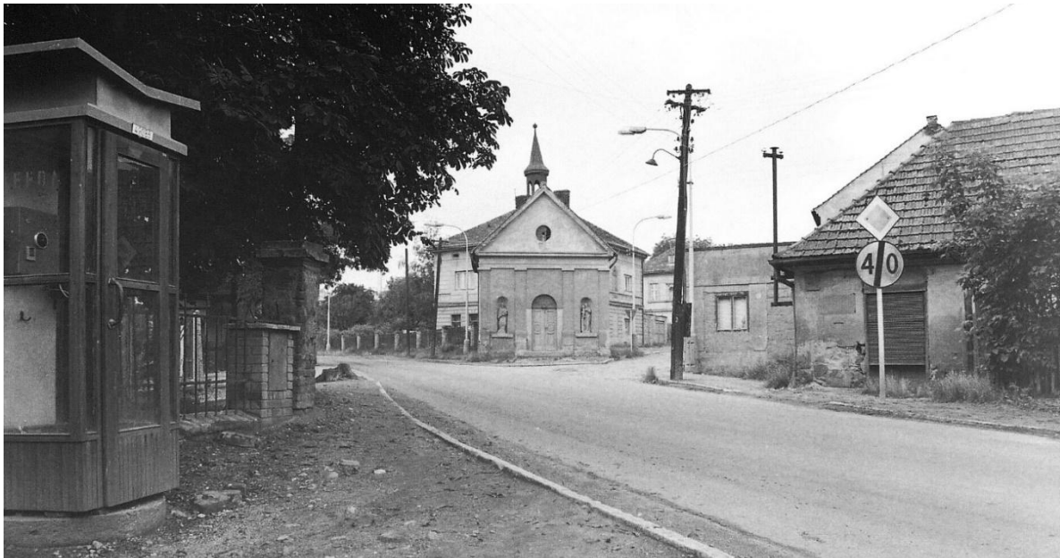
Figure 10.1: Dolní Krč – a village square with a chapel in 1978 before Jižní spojka construction.

houses were proposed in a unified style on land plots with an area of 800 m 2 (Sečkář, 2013). However, individualised construction created a mosaic of architectural styles and unusual decorative elements.