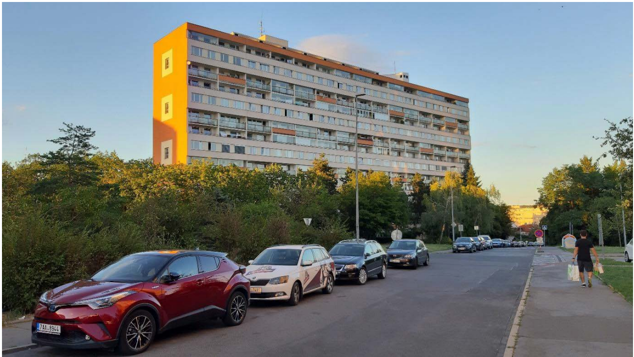
Figure 10.4: Maisonette flats at Krč housing estate.