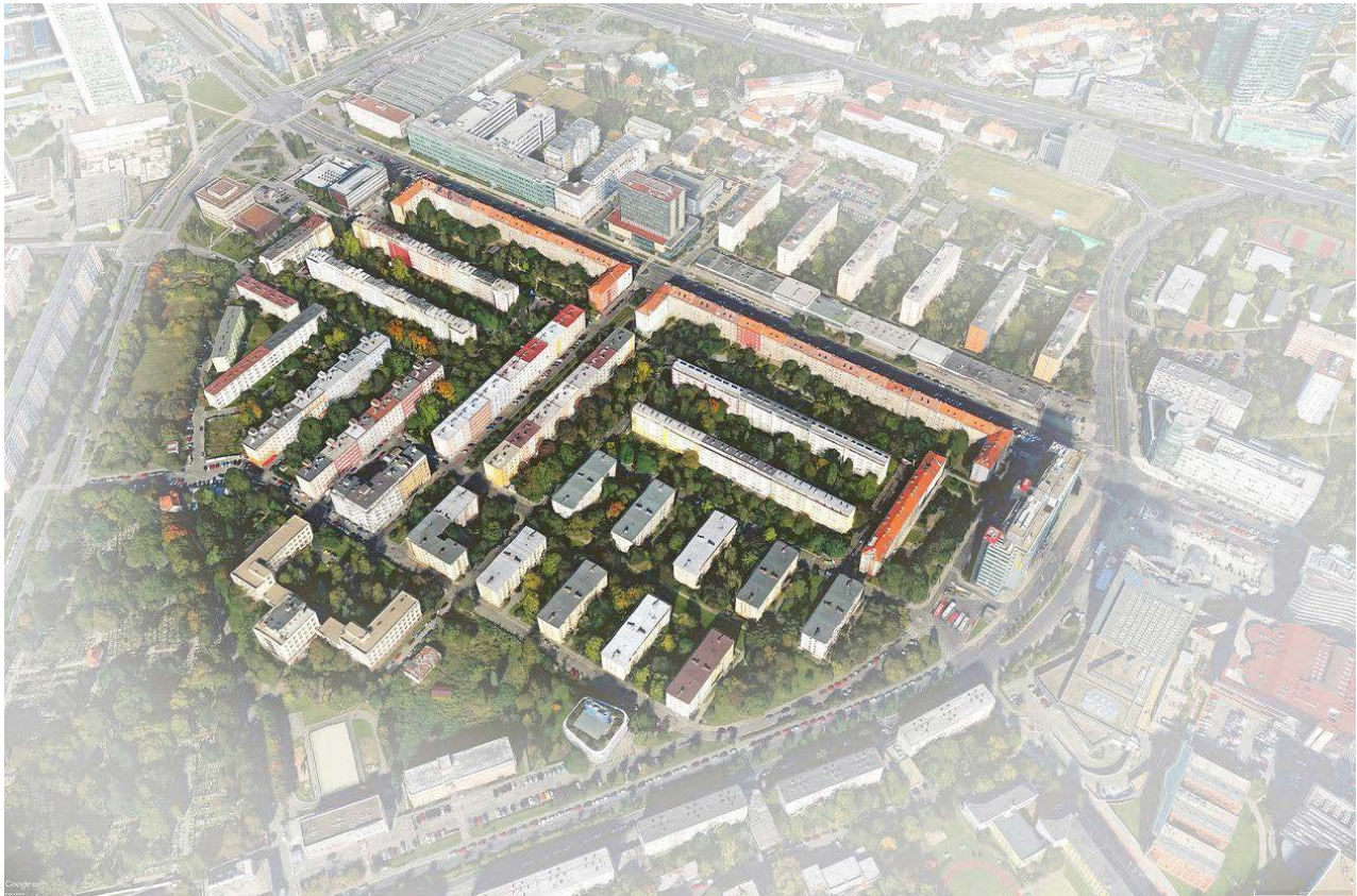
Figure 10.3: Zelená liška housing estate completed by Herálecká housing estate.

built from bricks and were fenced in. They were designed with collective spaces and amenities (e.g. laundry or courtyard balconies) serving as a floor. All the other collective elements designed by architect Antonín Černý were not realised. Typically, small flats of area 36-52 m 2 were designated for the poorest inhabitants of Prague (Helikarová, 2015). The planned urbanistic concept was suspended by the Second World War, but a few years after the war, two long rows of houses at Budějovická street were added as part of the two-year state economic plan (1947–1948).