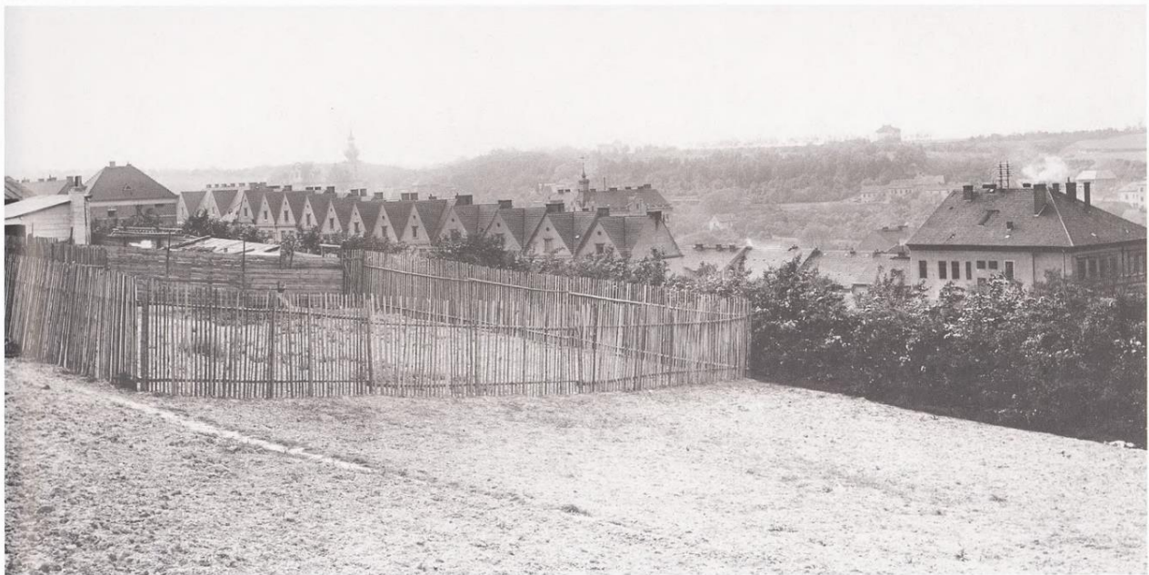
Figure 9.3: A view of the tenement housing in the street 8. listopadu.

The municipalities of the present-day Břevnov served to some extent as a residential area for the population working in the adjacent district of Strahov, where jobs in construction, brickyards, traditional handicrafts and metal production were located (Moravcová, 1978). The relatively high share of the population working in industry, trade and transport can be seen as a signal of the starting transformation from the formerly rural area into the urban settlement. Following the social changes, the physical environment changed as well, and the new housing construction started to follow urban architecture forms (see Figure 9.3). Bělová and Kalašová (2016) state that for the "old" Břevnov neighbourly relations of a village character were typical, including everyday favours between neighbours. The original residents "welcomed" the newcomers who settled in the newly built houses with a distrust. However, even later on, Břevnov did not lose its agricultural character completely. Jiří Král (1947) included Břevnov among the territories of the type "residential and agricultural periphery in the transition, from place to place with industry".