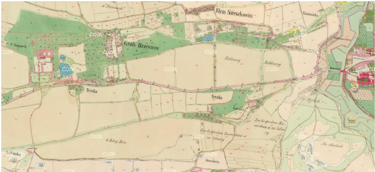
Figure 9.2: Map of the Stable Cadastre from 1843 with the detail of the villages Velký Břevnov, Tejnka and the former area "Na Skalách" (today's Strahov).