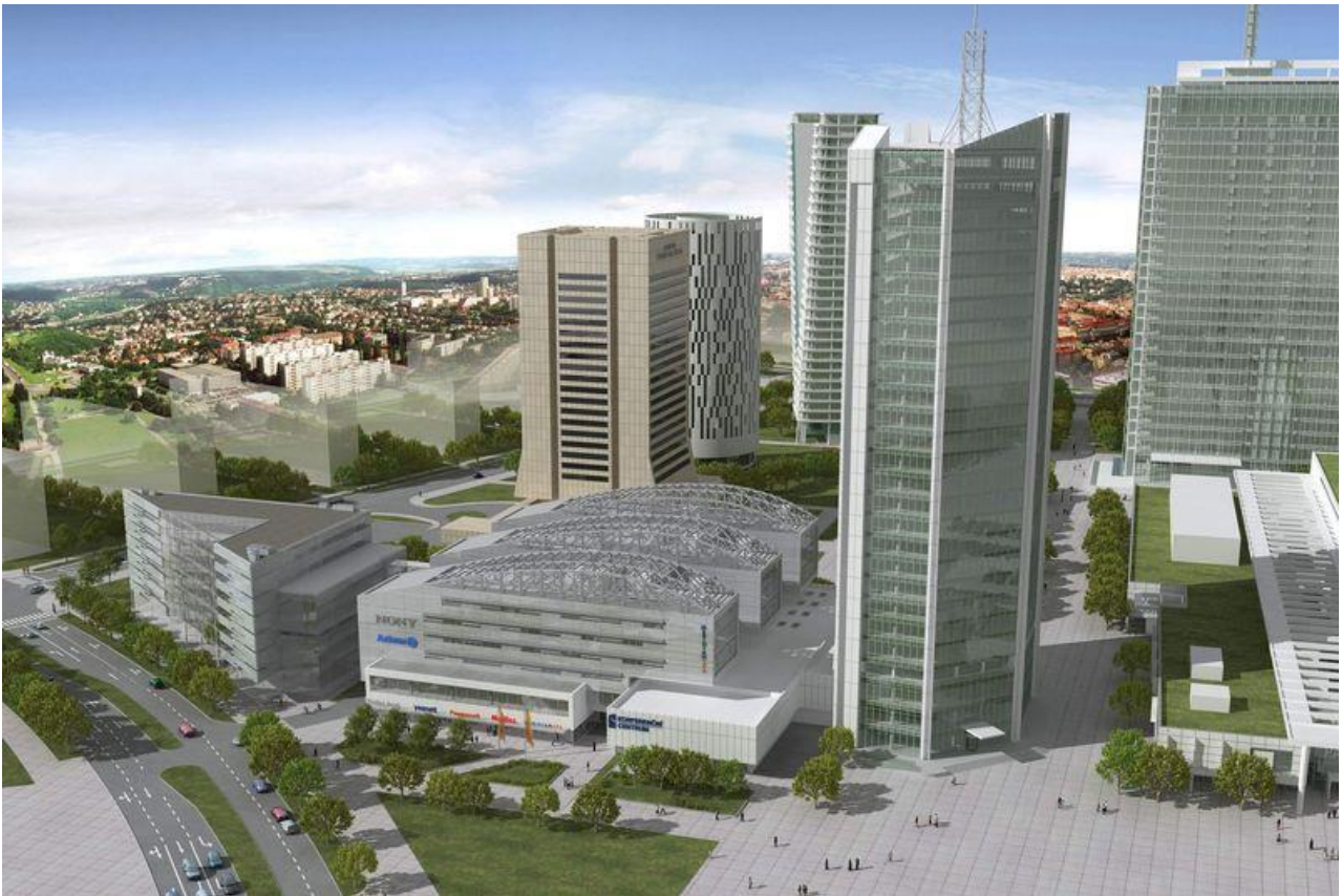
Figure 5. 2: Visualisation of the City Empiria building project by the architect Václav Aulický.