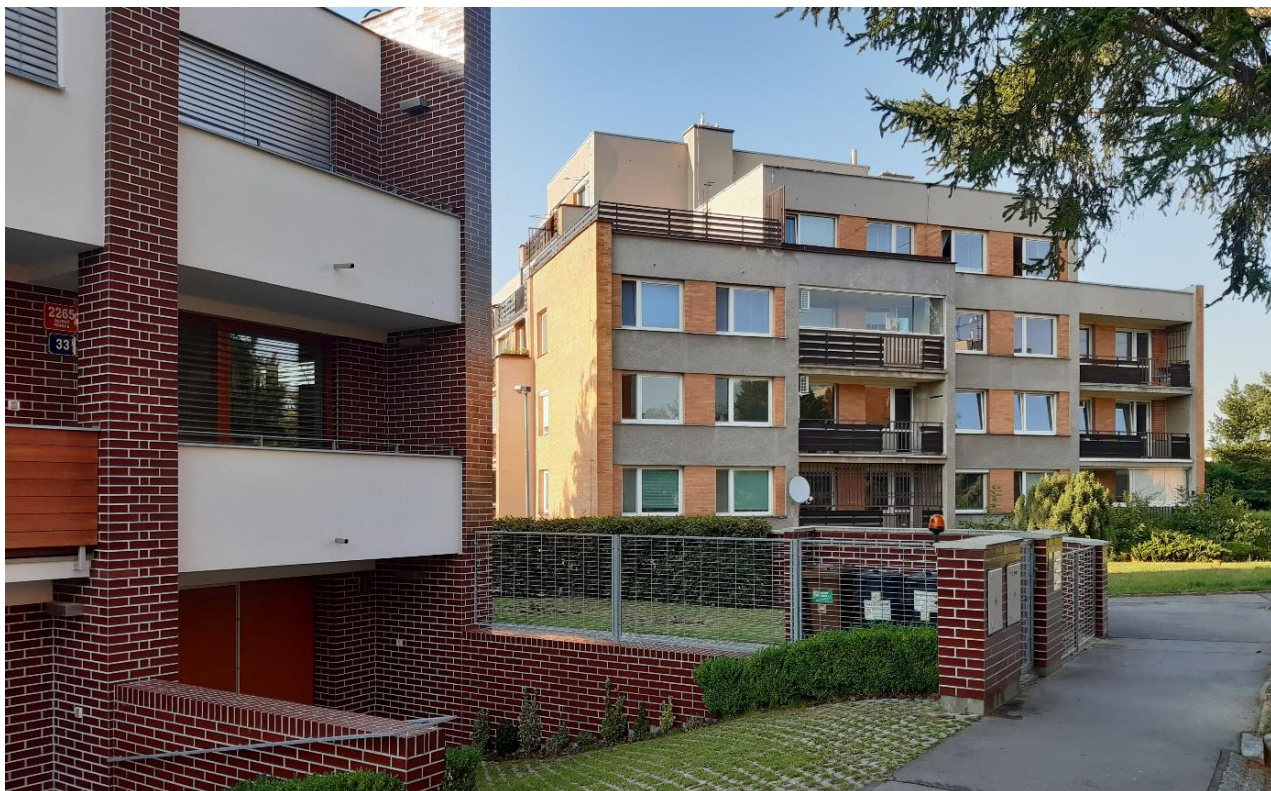
Figure 6.3: Socialist panel housing estate and terraced houses “Na Babě”. Photo: Adam Klsák (2020).

lived in tenement houses around Vítězné square, Jugoslávských partyzánů street and in Podbaba (especially districts Dejvická, Vozovna Podbaba or U Internacionálu). The foreign population in these areas mainly included Russians, Ukrainians and Slovaks. However, the composition of foreigners living in villa quarters (especially Hanspaulka) was different: mainly nationals of the European Union, such as Bulgarians, Germans, Italians, and Slovaks, lived there.