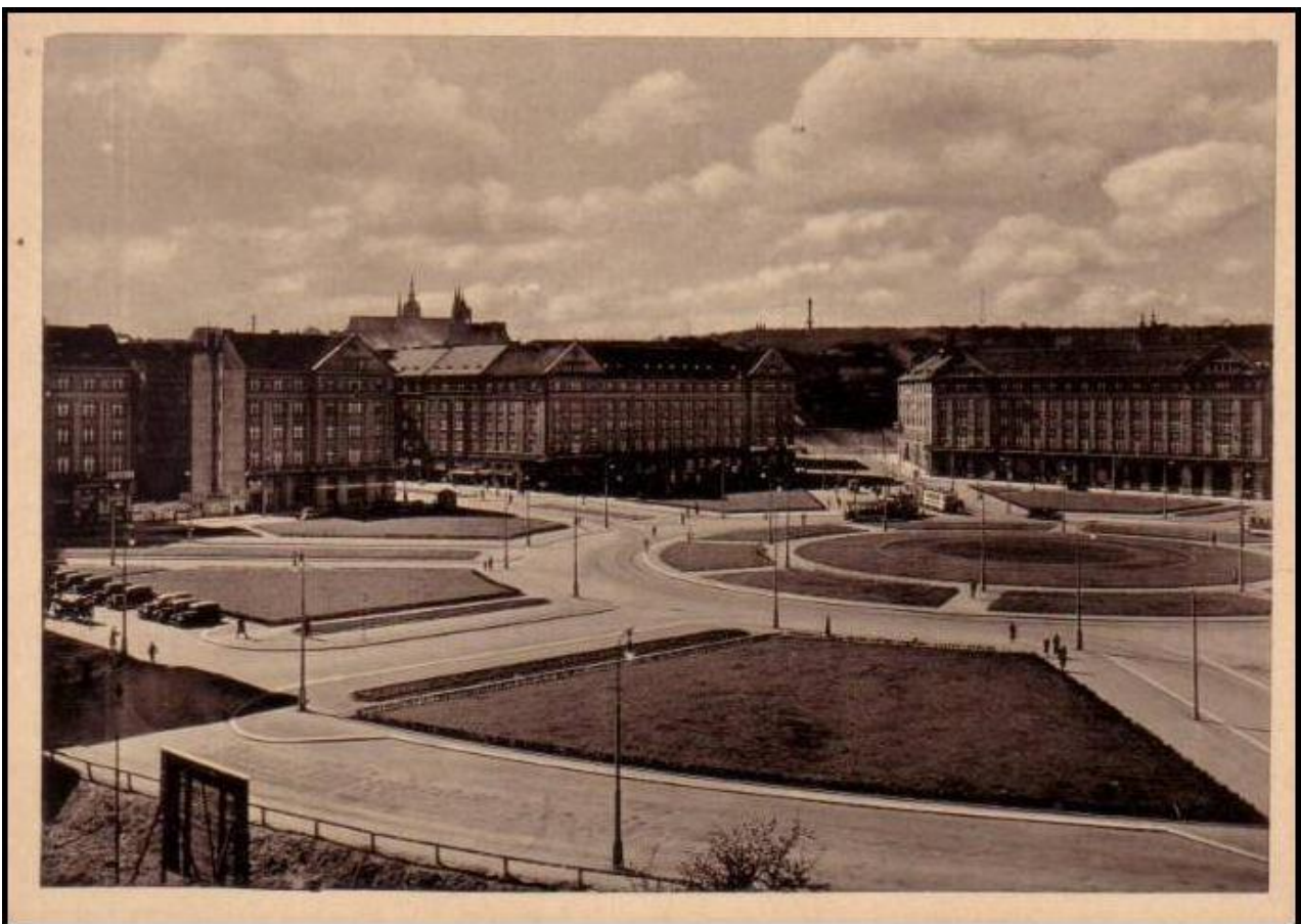
Figure 6.1: Vítězné náměstí [Victory square] in 1945.

became a priority again, focused primarily on the construction of large housing estates of the outer city (Musil, 1987; Ouředníček, Špačková, Pospíšilová, 2018). Dejvice continued to grow, but this period did not change its face so fundamentally – rather it followed the same face of previous development. Internacionál Hotel and its surroundings from the 1950s became a symbol of Prague's not very common socialist realism. The development of Hanspaulka was gradually supplemented by smaller collective housing projects, and since the 1960s Evropská třída has also been developing, which has become more important with the growth of housing estates to the west, and the university campus. The completion of the housing estate in Baba from the 1970s became the only larger and compact residential complex from the time of socialism in Dejvice. Due to its character, the housing estate is relatively sensitive to the surroundings, and in addition to six low-rise apartment buildings, it consists mainly of terraced houses.