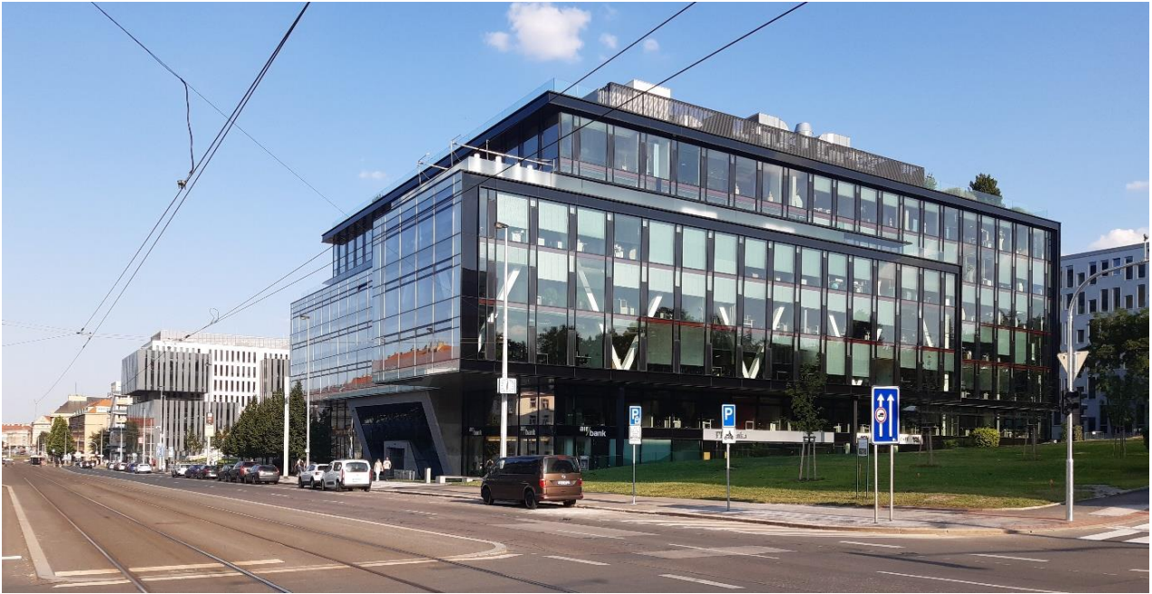
Figure 6.2: Administrative complex PPF Gate on Evropská street.

The fall of the communist regime was a stimulus for the development of Dejvice due to its return of freedoms and the re-integration of the city into global networks. The strategic location of the city axis brought further new development on Evropská street, where a larger number of administrative and commercial buildings were built (Figure 6.2). Some of the constructions had to give way to the intentions of the new investors, among them, for example, the Dejvice telephone exchange or the controversial Hotel Praha. The developers used ideal dispositions of the Šárka Valley for the construction of luxury areas of family houses and a completely new compact complex of apartment buildings was built on the site of the former malt house in Podbaba.