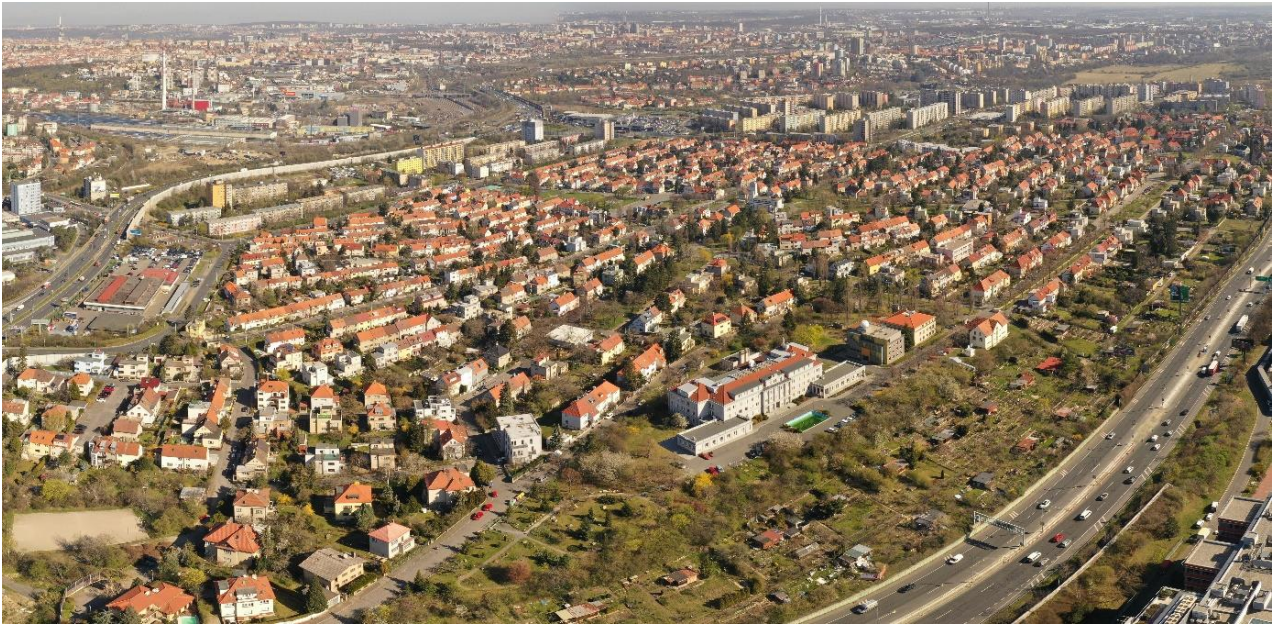
Figure 7.3: Contemporary view on Spořilov.